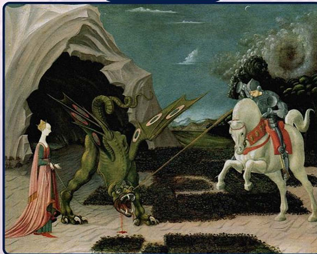
St George and the Dragon (1470)