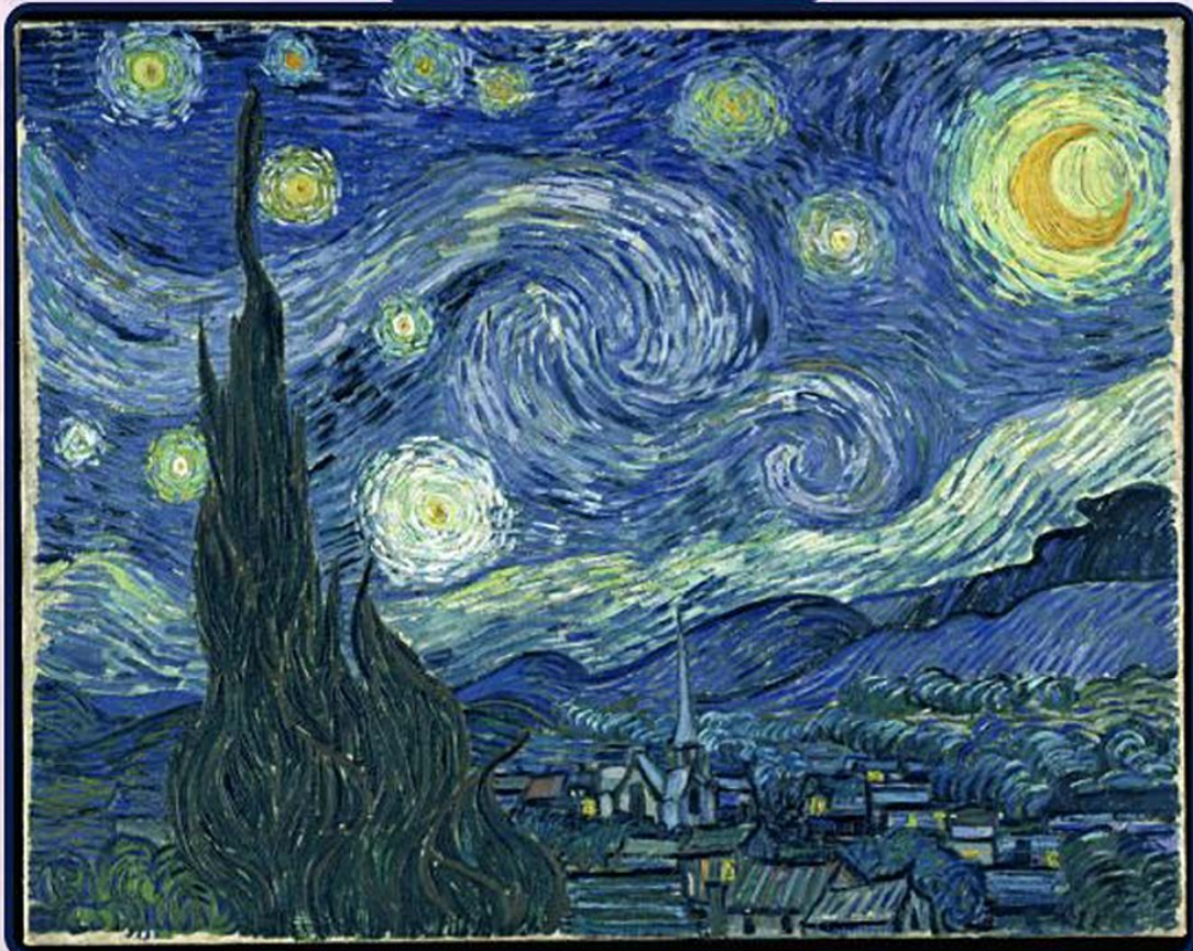
The Starry Night (1889)