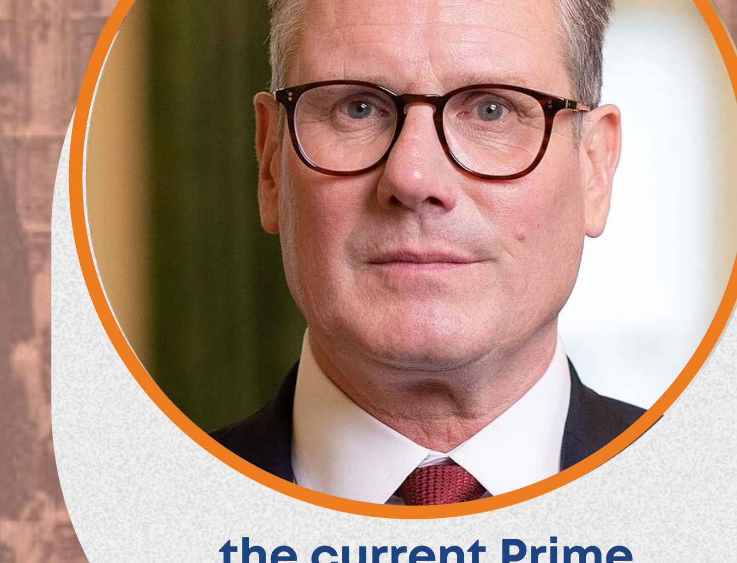
the current Prime Minister